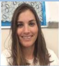
JHastings - OH