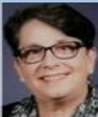
LLink – MI