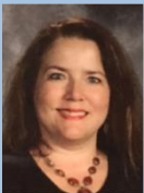
Laura Skjold Curriculum